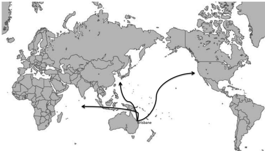
Containerised Ocean Transport Possibilities: Port of Brisbane to Potential Asian, West Coast USA & European Graphite Users

For more information on Graphitecorp please visit our website at www.graphitecorp.com.au